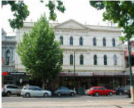
BEEHIVE BUILDING COMPLEX SOHE 2008