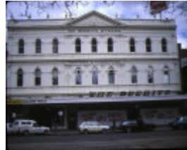
1 former mining exchange building bendigo front view beehive building