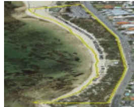
H2369 the brighton bathing boxes and dendy street beach air photo 21-11-2017.JPG