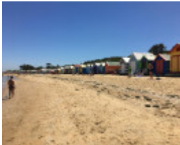
2017, looking north .jpg