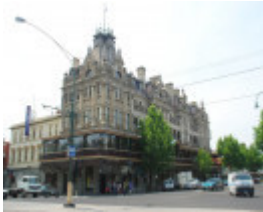
SHAMROCK HOTEL SOHE 2008