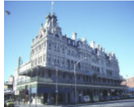
1 shamrock hotel bendigo front elevation jul1984