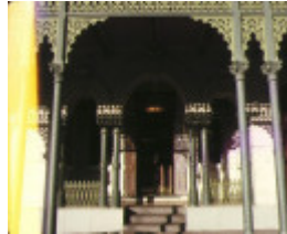
shamrock hotel bendigo entrance nov1989