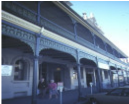
shamrock hotel bendigo front verandah jul1984