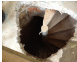
spiral stairway from hub to kitchen below.jpg