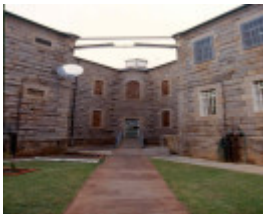
H1550 HM Prison Bendigo Between Cell Wings Aug 2003