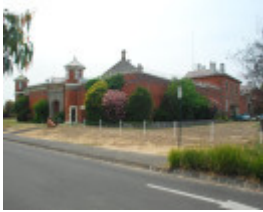
HM PRISON BENDIGO SOHE 2008