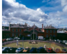
H1550 1 HM Prison Bendigo Front Wall Aug 2004