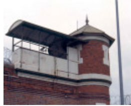
H1550 HM Prison Bendigo Tower and Guard Post 01 Aug 2004