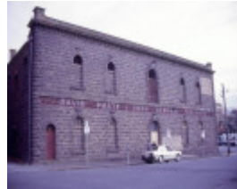
h00955 1 pratts warehouse mair and camp st ballarat east elevation she project 2003