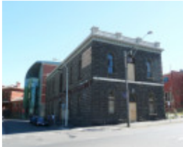
PRATTS WAREHOUSE SOHE 2008