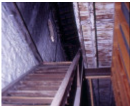
h00955 pratts warehouse mair and camp st ballarat stairs she project 2003