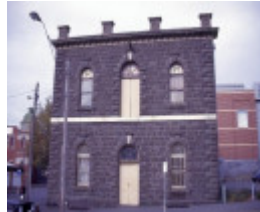
h00955 pratts warehouse mair and camp st ballarat front view she project 2003