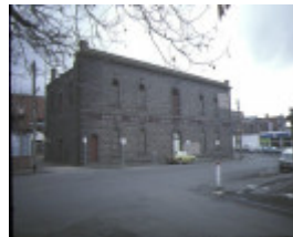
h00955 pratts warehouse camp street ballarat front view aug1985