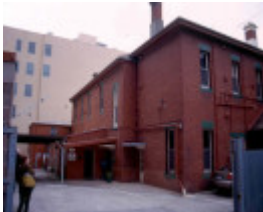
h01062 mary mckillop 1902 rear2