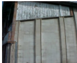
h01525 winchelsea grandstand side1