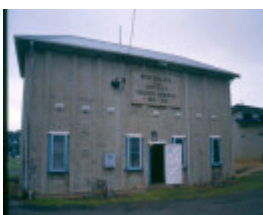
Winchelsea Grandstand Rear September 04