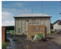
h01525 winchelsea grandstand longshot sept04