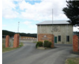
MEMORIAL GRANDSTAND AND GATES SOHE 2008