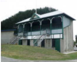
MEMORIAL GRANDSTAND AND GATES SOHE 2008