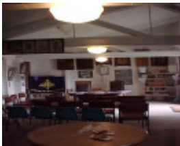
h01525 winchelsea grandstand rsl room general