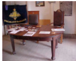
h01525 winchelsea grandstand rsl room table