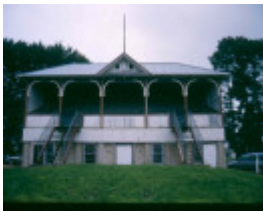
h01525 1 winchelsea grandstand front1