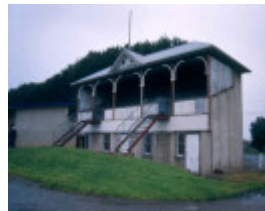
h01525 winchelsea grandstand front sept04