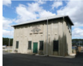
MEMORIAL GRANDSTAND AND GATES SOHE 2008