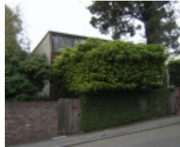
H2105 Boyd House Walsh St South Yarra 19 08 2005 mz 005 amended