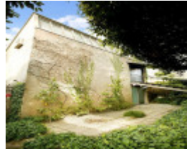
H2105 Boyd House 290 Walsh St South Yarra Robin Boyd