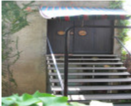
ROBIN BOYD HOUSE II SOHE 2008