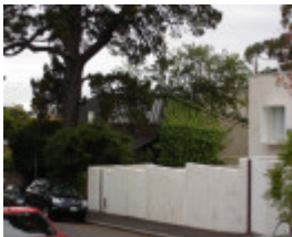
13584 Boyd House Walsh St South Front Facade Yarra 04 May 2006 mz