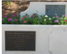
MENTONE RAILWAY STATION AND GARDENS SOHE 2008