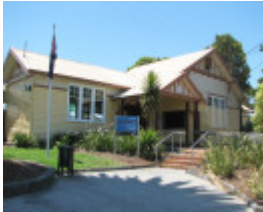
MENTONE RAILWAY STATION AND GARDENS SOHE 2008