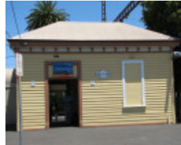
MENTONE RAILWAY STATION AND GARDENS SOHE 2008