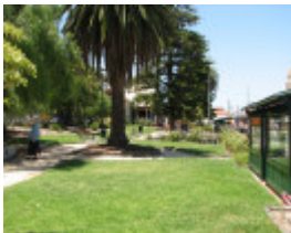
MENTONE RAILWAY STATION AND GARDENS SOHE 2008