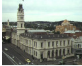
1 ballarat post office aerial view 1992