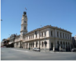
BALLARAT POST OFFICE SOHE 2008