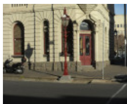
B1 - Reconstructed lamp set back 1m from street corner