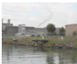
Commonwealth Fertilisers Wharves Maribyrnong July 2003 Wharf And Bollards