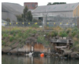
Commonwealth Fertilisers Wharves Maribyrnong July 2003 Iron Sheet Piling 002