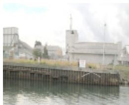
Commonwealth Fertilisers Wharves Maribyrnong July 2003 Iron Sheet Piling 001