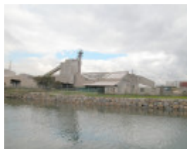
Commonwealth Fertilisers Wharves Maribyrnong July 2003 Commonwealth Fertilisers Factory