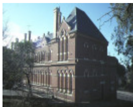
camp hill school 1976 bendigo rear corner jul1984