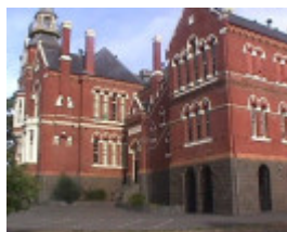
h01642 camp hill central school no 1976 gaol road rosalind park bendigo front cnr she project 2004