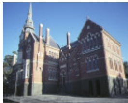
1 camp hill school 1976 bendigo front elevation jul1984