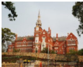
CAMP HILL CENTRAL SCHOOL NO.1976 SOHE 2008