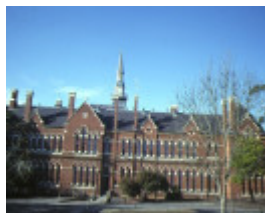
camp hill school 1976 bendigo rear view jul1984