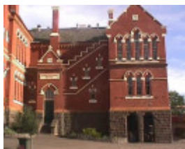
h01642 camp hill central school no 1976 gaol road rosalind park bendigo close up she project 2004