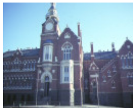
camp hill school 1976 bendigo front view