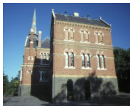
camp hill school 1976 bendigo side elevation jul1984