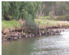
Riverview Teagardens Wharf And Slipway Maribyrnong May 2003 002