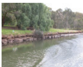
Riverview Teagardens Wharf And Slipway Maribyrnong May 2003 004