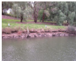
Riverview Teagardens Wharf And Slipway Maribyrnong May 2003 003