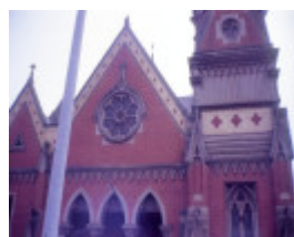
former congregational church and hall mair and dawson sts north ballarat windows she project 2004