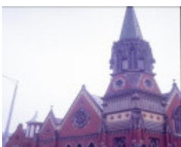
former congregational church and hall mair and dawson sts north ballarat steeple she project 2004