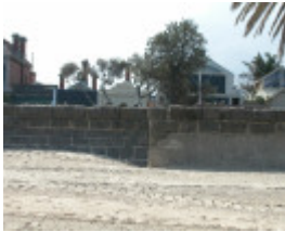
McGregor St Unidentified Bluestone Scatter Port Melbourne March 2003 001