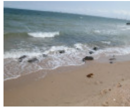
McGregor St Unidentified Bluestone Scatter Port Melbourne March 2003 003