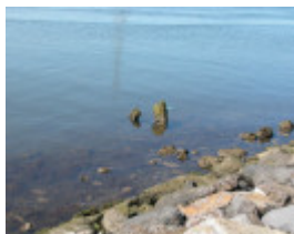
Spotswood Pumping Station Wharf Piles Williamstown May 2003