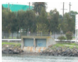
Spotswood Pumping Station Wharf Piles Williamstown May 2003 Overflow Outlet 002