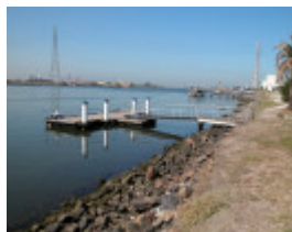
Spotswood Pumping Station Wharf Piles Williamstown May 2003 BoatLanding