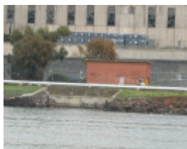
Spotswood Pumping Station Wharf Piles Williamstown May 2003 Overflow Outlet 001