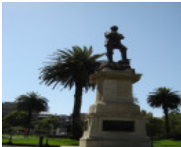
h00047 gordon memorial