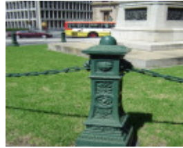
h00047 fence post