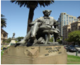
Detail Adam Lindsay Gordon