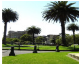
h00047 gordon reserve2