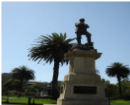
h00047 gordon memorial