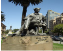
Detail Adam Lindsay Gordon