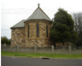
13944 Holy Trinity Church Coleraine 4Sept06 east facade3