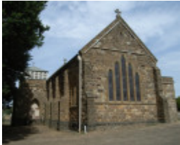
HOLY TRINITY ANGLICAN CHURCH COMPLEX SOHE 2008