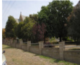
HOLY TRINITY ANGLICAN CHURCH COMPLEX SOHE 2008