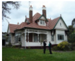
13944 Holy Trinity Church Coleraine 4Sept06 rectory north2