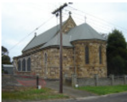
H0246 Holy Trinity Church Coleraine 4Sept06 south east exterior2