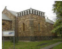
13944 Holy Trinity Church Coleraine 4sept06 belltower