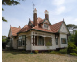
HOLY TRINITY ANGLICAN CHURCH COMPLEX SOHE 2008