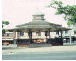
1 queen alexandra bandstand ballarat front detail