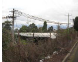
Maribyrnong substation view from above