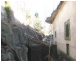
Maribyrnong substation quarry wall at rear