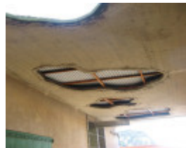
Maribyrnong substation cutouts in concrete roof