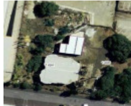
Maribyrnong substation aerial view