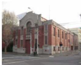
front and east side