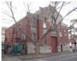
Carlton tram substation front and west side