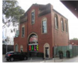
South Yarra tram substation