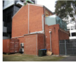
South Yarra tram substation rear view