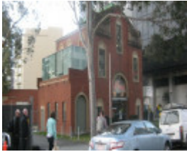
Tram substation Sth Yarra 5 Sep 2012 KJ (1).JPG