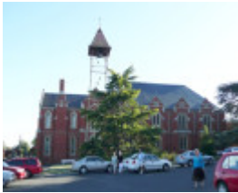
ST PATRICKS CATHEDRAL AND HALL SOHE 2008