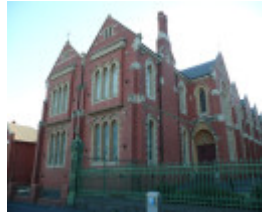
ST PATRICKS CATHEDRAL AND HALL SOHE 2008