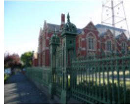
ST PATRICKS CATHEDRAL AND HALL SOHE 2008