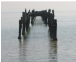
H2088 Clifton Springs Aug 05 long jetty