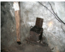
H0198 Wonthaggi State Coal Mine Eastern Precinct H198 July 2007 PM2 dunny16