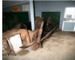
H0198 Wonthaggi State Coal Mine Eastern Precinct H198 July 2007 PM2 SCM underground winch49