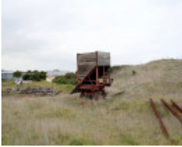
H0198 Wonthaggi State Coal Mine Eastern Precinct H198 July 2007 PM2 lizzie27