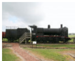
H0198 Wonthaggi State Coal Mine Eastern Precinct H198 July 2007 PM2 loco28