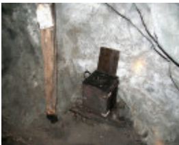
H0198 Wonthaggi State Coal Mine Eastern Precinct H198 July 2007 PM2 dunny16