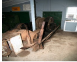
H0198 Wonthaggi State Coal Mine Eastern Precinct H198 July 2007 PM2 SCM underground winch49