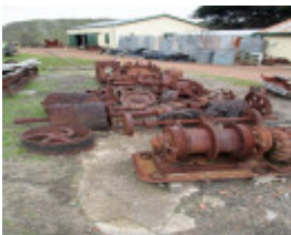
H0198 Wonthaggi State Coal Mine Eastern Precinct H198 July 2007 PM2 rollers46