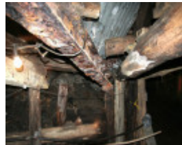
H0198 Wonthaggi State Coal Mine Eastern Precinct H198 July 2007 PM2 steel beam52