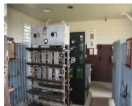
H0198 Wonthaggi State Coal Mine Eastern Precinct H198 July 2007 PM2 lamphouse interior25