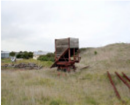
H0198 Wonthaggi State Coal Mine Eastern Precinct H198 July 2007 PM2 lizzie27