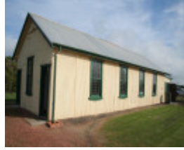
H0198 Wonthaggi State Coal Mine Eastern Precinct H198 July 2007 PM2 lamp house24