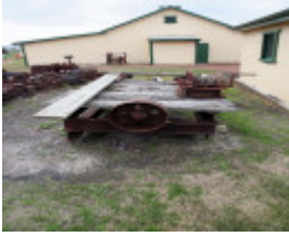
H0198 Wonthaggi State Coal Mine Eastern Precinct H198 July 2007 PM2 sawmill48