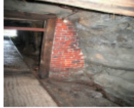
H0198 Wonthaggi State Coal Mine Eastern Precinct H198 July 2007 PM2 air door04