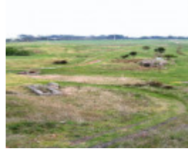
H0198 Wonthaggi State Coal Mine Eastern Precinct H198 July 2007 PM2 winder engine footings 61