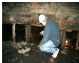
H0198 Wonthaggi State Coal Mine Eastern Precinct H198 July 2007 PM2 thin seam54