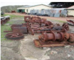
H0198 Wonthaggi State Coal Mine Eastern Precinct H198 July 2007 PM2 rollers46