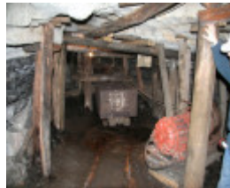
H0198 Wonthaggi State Coal Mine Eastern Precinct H198 July 2007 PM2 fork20