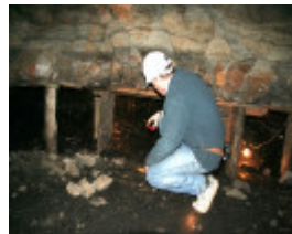
H0198 Wonthaggi State Coal Mine Eastern Precinct H198 July 2007 PM2 thin seam54