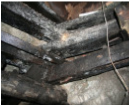
H0198 Wonthaggi State Coal Mine Eastern Precinct H198 July 2007 PM2 crib in roof12