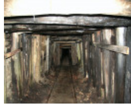
0198 Wonthaggi State Coal Mine Eastern Area Back tunnel incline