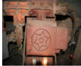
H0198 Wonthaggi State Coal Mine Eastern Precinct H198 July 2007 PM2 drill work14