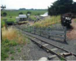
WONTHAGGI STATE COAL MINE (EASTERN PRECINCT) SOHE 2008