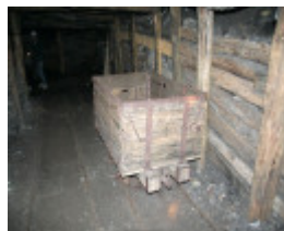
H0198 Wonthaggi State Coal Mine Eastern Precinct H198 July 2007 PM2 trolley55