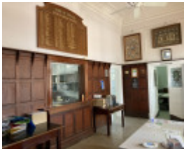
4 best foyer