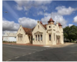
3 distant front photo