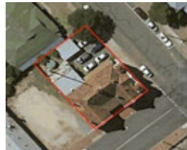
Donald Offices - Aerial 2023