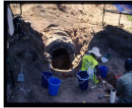
H2106 Chinese Kiln nov 2005 photo 7.jpg