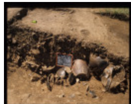
CHINESE KILN & MARKET GARDEN