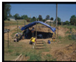
H2106 Chinese Kiln nov 2005 photo 4.jpg