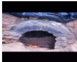
Chinese Kiln Bendigo.jpg