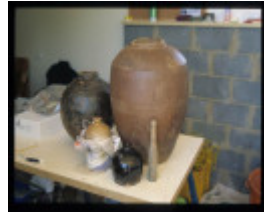
H2106 Chinese Kiln nov 2005 photo 21.jpg