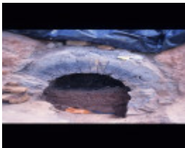
CHINESE KILN & MARKET GARDEN