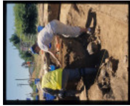
H2106 Chinese Kiln nov 2005 photo 12.jpg