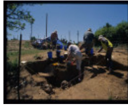
H2106 Chinese Kiln nov 2005 photo 13.jpg