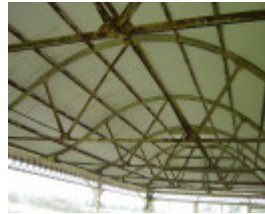
14252 Hamilton racecourse 4Sept06 grandstand roof