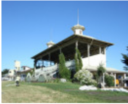
HAMILTON RACECOURSE GRANDSTAND SOHE 2008