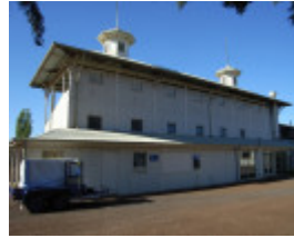
HAMILTON RACECOURSE GRANDSTAND SOHE 2008