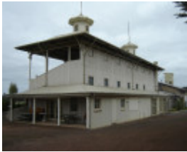
14252 Hamilton racecourse 4Sept06 side rear