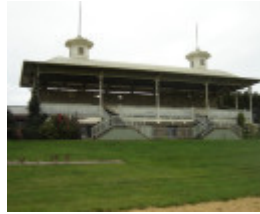
14252 Hamilton racecourse 4Sept06 grandstand7