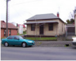
20 Barkly Street