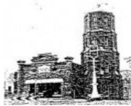
East Ballarat Fire Station - Ballarat Heritage Review, 1998