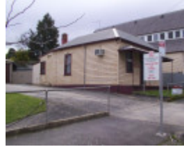
20 Barkly Street