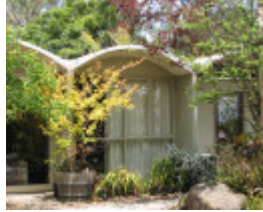
RICE HOUSE SOHE 2008