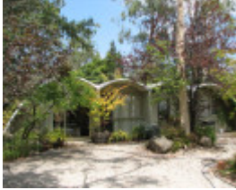
RICE HOUSE SOHE 2008