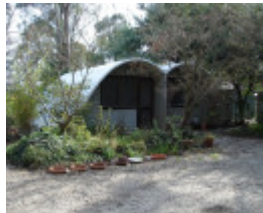
14272 Rice House Eltham May 06 childrens house