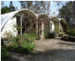
14272 Rice House Eltham May 06 main house