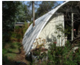
14272 Rice House Eltham May 06 Main house detail