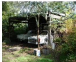
14272 Rice House Eltham May 06 carport