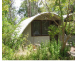
RICE HOUSE SOHE 2008