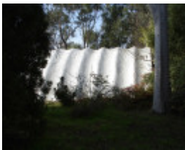
14272 Rice House Eltham May 06 main house side view