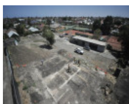
aerial image of site visit 22/1/14