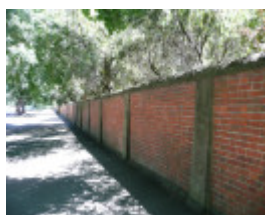
FORMER MARYS MOUNT CONVENT SOHE 2008