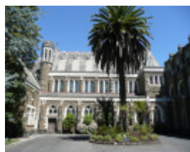
FORMER MARYS MOUNT CONVENT SOHE 2008