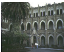
1 loreto convent ballarat abbey side view