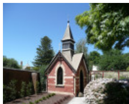
FORMER MARYS MOUNT CONVENT SOHE 2008