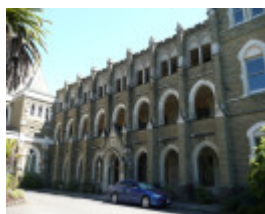
FORMER MARYS MOUNT CONVENT SOHE 2008