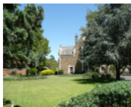
FORMER MARYS MOUNT CONVENT SOHE 2008