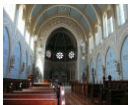
FORMER MARYS MOUNT CONVENT SOHE 2008