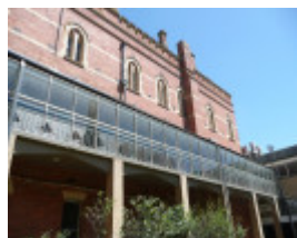
FORMER MARYS MOUNT CONVENT SOHE 2008