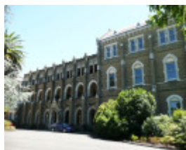
FORMER MARYS MOUNT CONVENT SOHE 2008