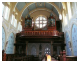
FORMER MARYS MOUNT CONVENT SOHE 2008