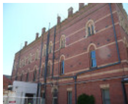
FORMER MARYS MOUNT CONVENT SOHE 2008