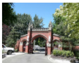
FORMER MARYS MOUNT CONVENT SOHE 2008