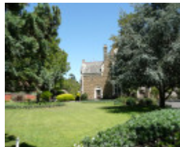
FORMER MARYS MOUNT CONVENT SOHE 2008