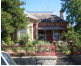
16 Seymour Crescent