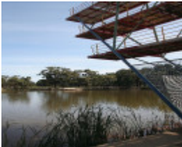
H0398 Callembeen Pk 14 Feb 07 PM2 Main Pool