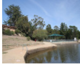
H0398 Callembeen Pk 14 Feb 07 PM2 Wading Pool