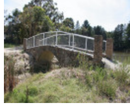
H0398 Callembeen Pk 14 Feb 07 PM2 Footbridge