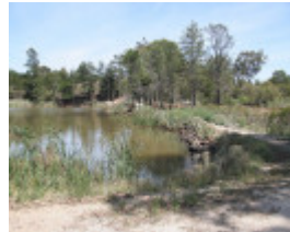
H0398 Callembeen Pk 14 Feb 07 PM2 Back Pond 1