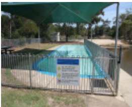
H0398 Callembeen Pk 14 Feb 07 PM2 Toddlers Pool