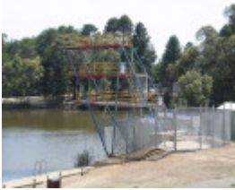
H0398 Callembeen Pk 14 Feb 07 PM2 Diving Tower