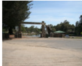
H0398 Callembeen Pk 14 Feb 07 PM2 Gateway