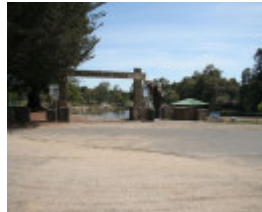
H0398 Callembeen Pk 14 Feb 07 PM2 Gateway