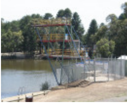
H0398 Callembeen Pk 14 Feb 07 PM2 Diving Tower