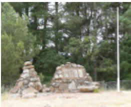
Memorial BUNDORAN LANE and CNR HAMILTON CHATSWORTH ROAD GLENTHOMPSON, 14442 P1050864