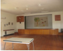
Woodhouse-Nareeb Soldiers Memorial Hall