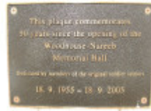
Woodhouse-Nareeb Soldiers Memorial Hall