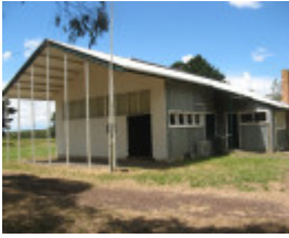
Woodhouse-Nareeb Soldiers Memorial Hall