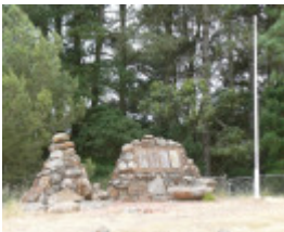
Memorial BUNDORAN LANE and CNR HAMILTON CHATSWORTH ROAD GLENTHOMPSON, 14442 P1050864