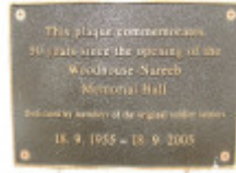
Woodhouse-Nareeb Soldiers Memorial Hall