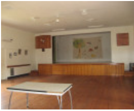
Woodhouse-Nareeb Soldiers Memorial Hall