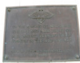
Woodhouse-Nareeb Soldiers Memorial Hall