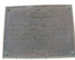
Woodhouse-Nareeb Soldiers Memorial Hall