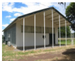
Woodhouse-Nareeb Soldiers Memorial Hall