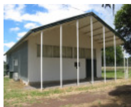
Woodhouse-Nareeb Soldiers Memorial Hall