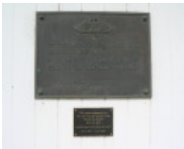
Plaque WOODHOUSE-NAREEB SOLDIERS MEMORIAL HALL 14442 P1050867