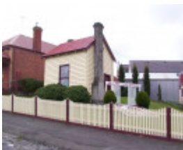
22 Barkly Street