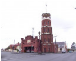
22 Barkly Street