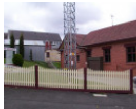
22 Barkly Street