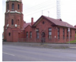
22 Barkly Street