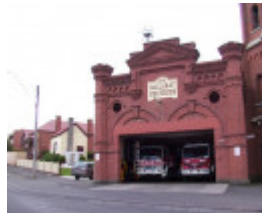
22 Barkly Street