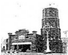
East Ballarat Fire Station - Ballarat Conservation Study, 1978