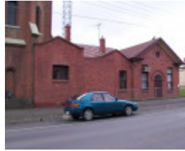
22 Barkly Street