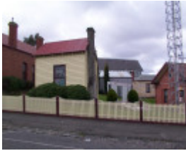
22 Barkly Street