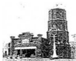
East Ballarat Fire Station - Ballarat Heritage Review, 1998