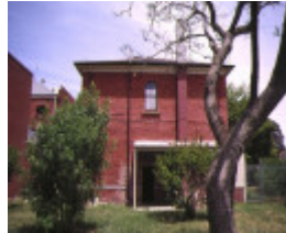
dudley house bendigo rear view nov1998