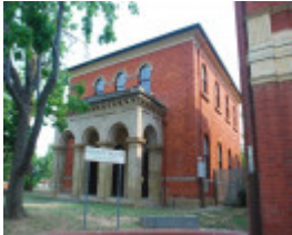
DUDLEY HOUSE SOHE 2008