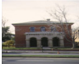
1 dudley house bendigo front elevation 1998