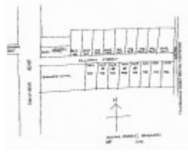
House at 10 Ellison St