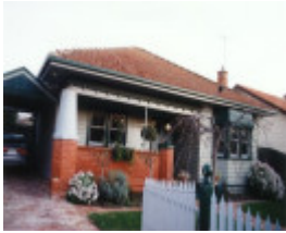
House at 10 Ellison St