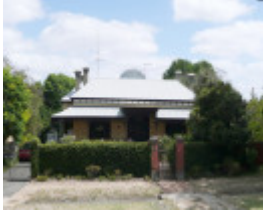
YARROWEE HALL SOHE 2008