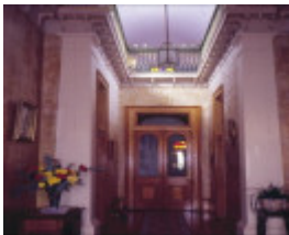
h01168 yarrowee hall darling street ballarat grand hall atrium above she project 2003