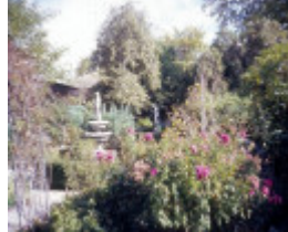
h01168 yarrowee hall darling street ballarat front garden she project 2003