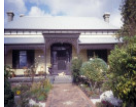
h01168 1 yarrowee hall darling street ballarat facade of house she project 2003