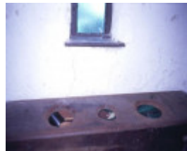
h01168 yarrowee hall darling street ballarat three seater outhouse she project 2003