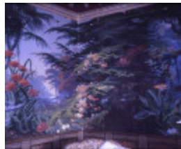
h01168 yarrowee hall darling street ballarat wallpaper detail she project 2003