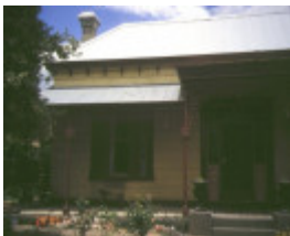
h01168 yarrowee hall darling street ballarat front elevation