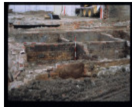
GROSVENOR STREET TANNERY SITE