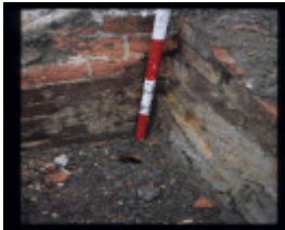
GROSVENOR STREET TANNERY SITE