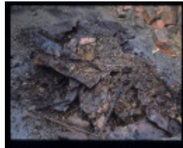
GROSVENOR STREET TANNERY SITE