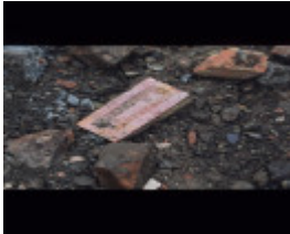
GROSVENOR STREET TANNERY SITE