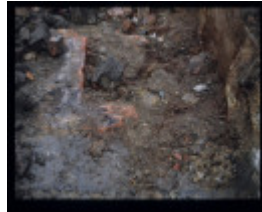
GROSVENOR STREET TANNERY SITE