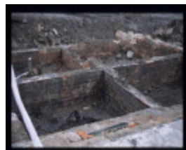
GROSVENOR STREET TANNERY SITE