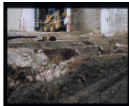
GROSVENOR STREET TANNERY SITE