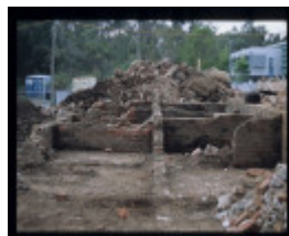
GROSVENOR STREET TANNERY SITE