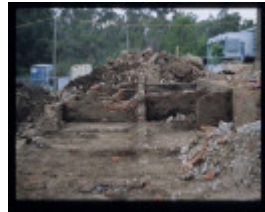
GROSVENOR STREET TANNERY SITE