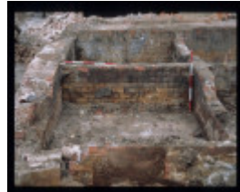
GROSVENOR STREET TANNERY SITE