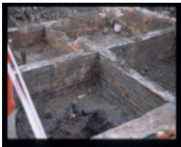
GROSVENOR STREET TANNERY SITE