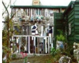
H01982 old curiosity shop exterior nov 2001