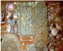
H01982 old curiosity shop think of the old man nov 2001