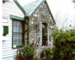
H01982 old curiosity shop nov 2001