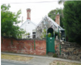
OLD CURIOSITY SHOP SOHE 2008