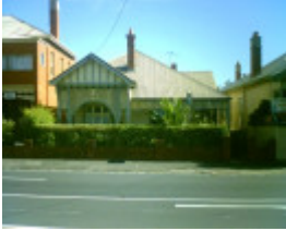
4 Aberdeen Street, Geelong West