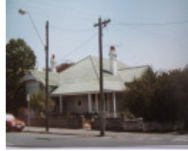
Aberdeen 10_1986 Study.JPG