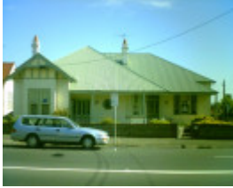
10 Aberdeen Street, Geelong West