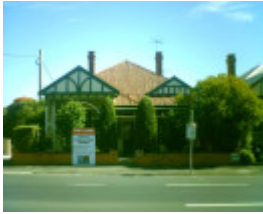
18 Aberdeen Street, Geelong West