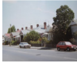
Source: Aitken, Honman & Huddle, 'City of Geelong West Urban Conservation Study', 1986. - Street View