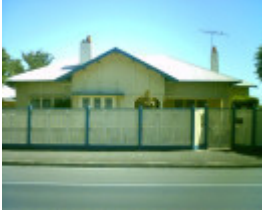
84 Aberdeen Street, Geelong West