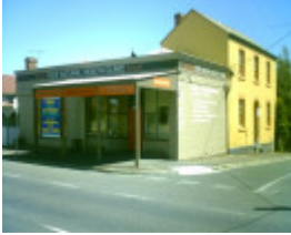
148 Aberdeen Street, Geelong West