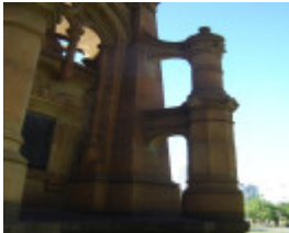
boer war memorial buttress Nov06 jb