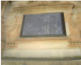
plaque1 boer war memorial st kilda rd nov06 jb