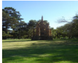
boer war memorial full view nov 06 jb