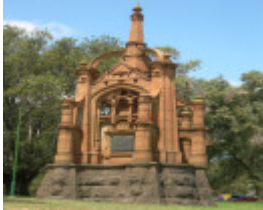
BOER WAR MONUMENT SOHE 2008