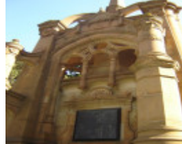
boer war memorial detail nov06 jb