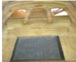
plaque3 boer war memorial stkilda rd jb