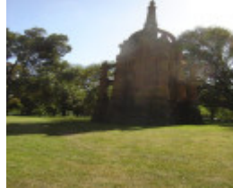
boer war memorial nov06 jb