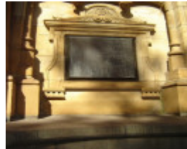
plaque2 boer war memorial stkilda rd2 nov06 jb