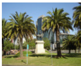
H0366 linlithgow monument1 Nov 06 jb