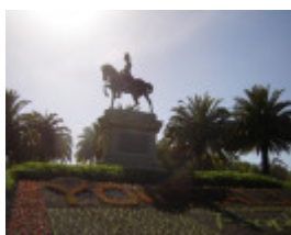
linlithgow monument stkilda rd2 Nov06 jb