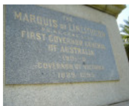
H0366 plaque linlithgow monument Nov06 jb