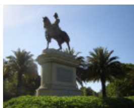
H0366 linlithgow monument stkilda rd nov06 jb