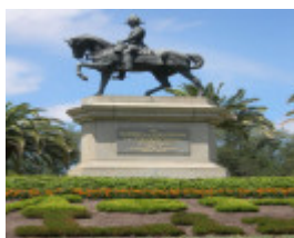
MARQUIS OF LINLITHGOW MEMORIAL SOHE 2008