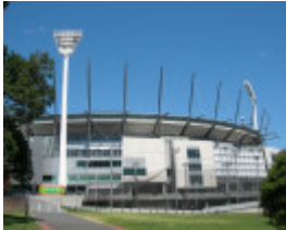
MELBOURNE CRICKET GROUND SOHE 2008